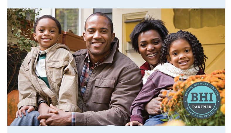
Start your homeownership journey!

The goal of the Black Home Initiative (BHI) is to create opportunity for 1,500 low-and moderate-income Black households to own a home in South Seattle, South King County, and North Pierce County within the next five years.